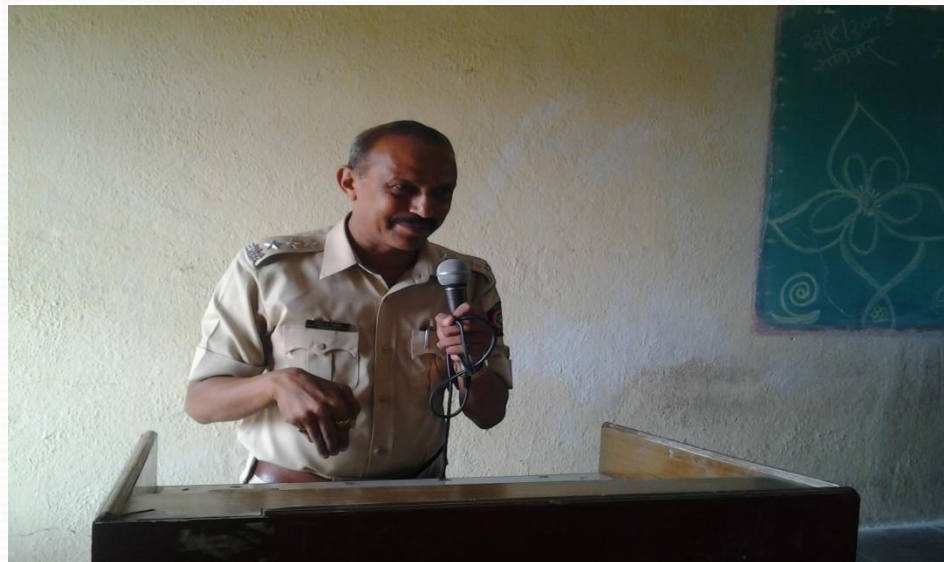
Police Mitra Program