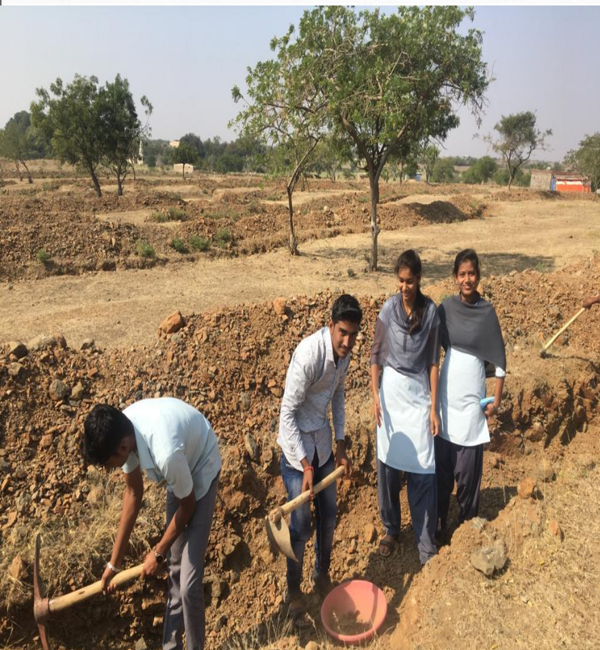
Special Camp- Field Work