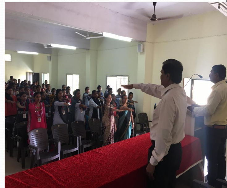
Fit India Program