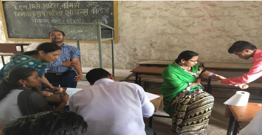
CBC Checking Camp