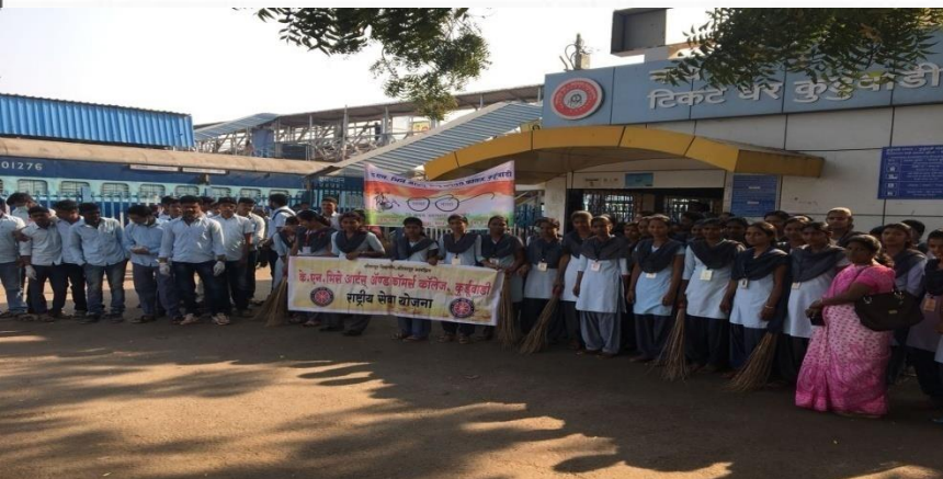
Railway Station Cleaning Program