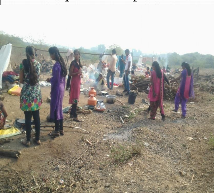
Special Camp- Awareness Rally