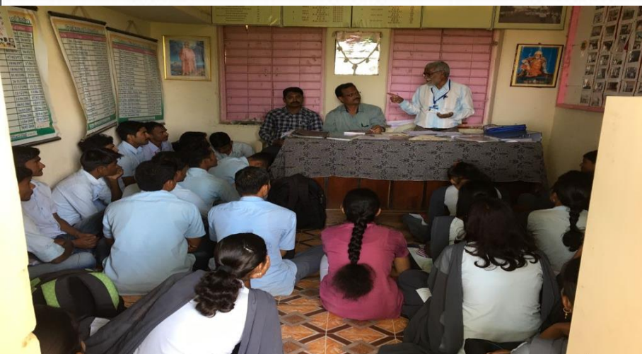
Leprosy survey program