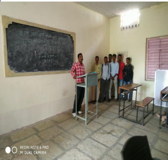
Vachan Prerna Din