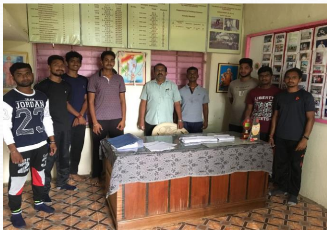
Celebration of Gandhi Jayanti