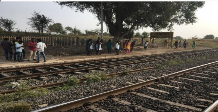
Special Camp- Field Work