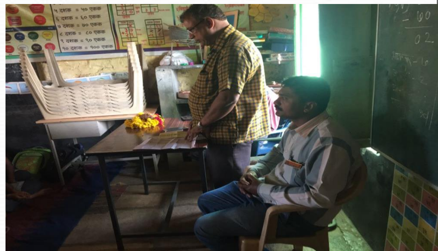
Special Camp Visit to Coordinator