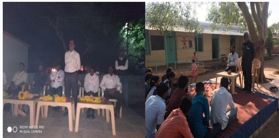
Motivational Speeches for Students