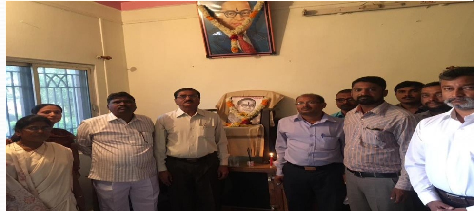
Calibration of Constitution Day