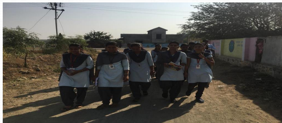
Survey in village for very us Problem