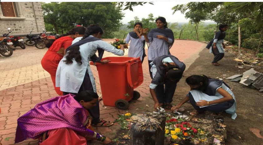
Chinchgaon Mahadeo Tekadi Cleaning Camping